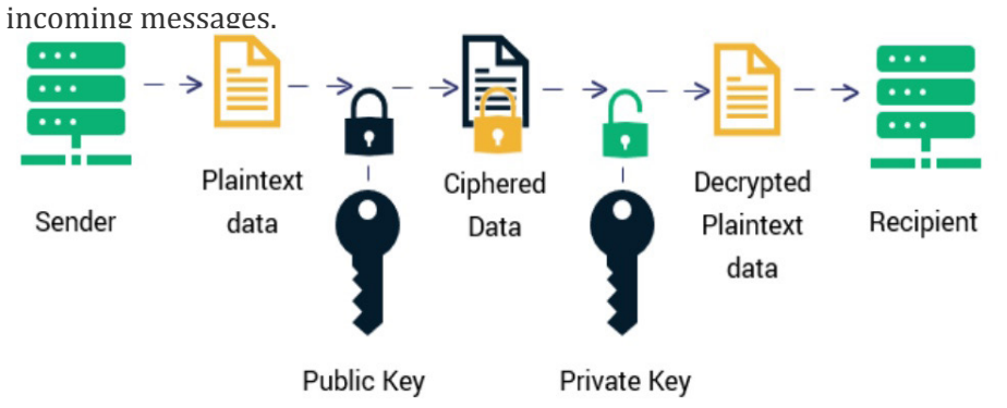
Figure 1. Public Key - Private Key [SS]

You can get an S/MIME certificate from a trusted certificate authority (CA) and use this to digitally sign your outgoing messages and to decrypt your